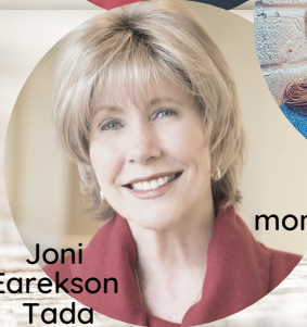
Joni Earekson Tada

This just in... the event will be livestreamed for those who cannot attend in person!