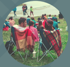
BRING YOUR COMFY CHAIRS

Please RSVP by September 19 at crosspointchino.org/adventure or call 909.606.9833