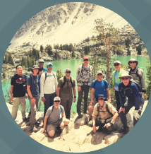
SHARE MAW STORIES

Have you ever attended Men's Adventure? Then come to the reunion picnic and bring the whole family!