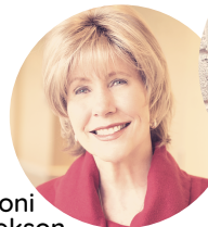
Joni Earekson Tada

WHO WILL YOU INVITE TO FRESH GROUNDED FAITH THIS YEAR?