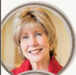
JONI EARECKSON TADA author, founder Joni & Friends