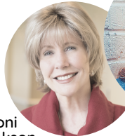
Joni Earekson Tada

Monday, August 16 at 6:30 PM CrossPoint Student Center